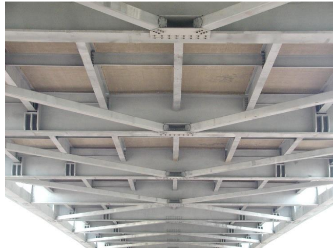
Figure 9 Photo of a typical framed floor system

Framed floor systems use a series of simple span stringers that frame into the floorbeam webs. When faced with depth restrictions, framed systems serve to reduce the overall depth of the floor system by the depth of the stringers.