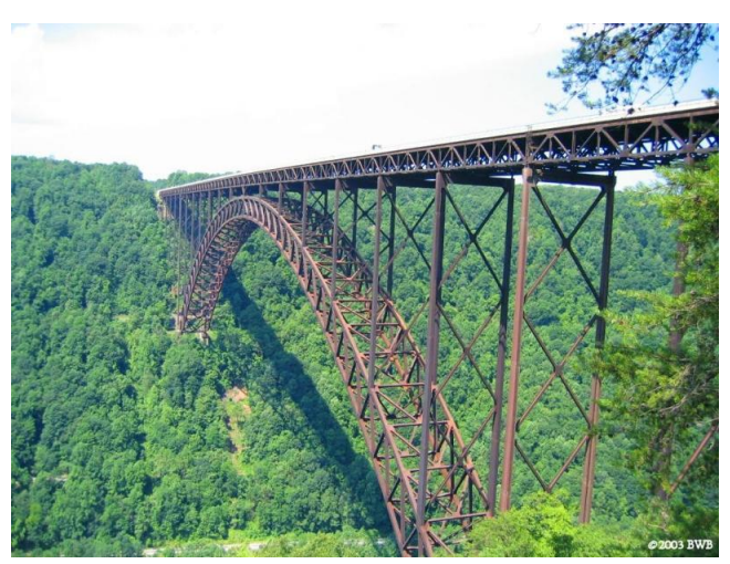
Figure 10 Photo a steel deck arch bridge (New River Gorge Bridge near Fayetteville, West Virginia)

Tied arches are generally more effective in cases where deep foundations are required or where high piers may be required to achieve a desired clearance under the bridge, such as a long span crossing a river where a navigation clearance envelope must be provided.