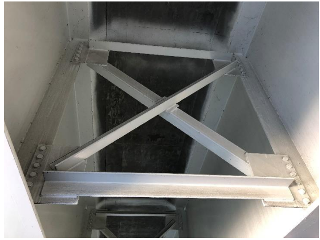
Figure 1 Photo of a typical multi-girder system with x-type intermediate cross-frames

Cross-frames or diaphragms have been provided at a maximum spacing of 25 feet for many years in accordance with the provisions of the AASHTO Standard Specifications for Highway Bridges (2002) [3]. The AASHTO LRFD Bridge Design Specifications, 9<sup>th</sup> Edition (AASHTO LRFD BDS) (2020) [4] does not include the historical 25 foot maximum spacing requirement of earlier AASHTO specifications and leaves the spacing up to the designer. The intent was solely to remove what was an arbitrary limit that sometimes led to inefficient framing plans; 25' to 30' is still a good target for maximum cross-frame spacing. Using cross-frame spacings larger than this range typically leads to uneconomical girder designs and can produce undesirable second-order amplification of flange lateral bending effects. Note that in some cases, such as in severely skewed bridges, omitting select cross-frames or using lean-on bracing details may provide both better performance and improved economy, while still providing adequate bracing for the girders. For a more complete discussion of cross-frame spacing and configurations, refer to the NSBA's Steel Bridge Design Handbook: Stringer Bridges – Making the Right Choices [5].