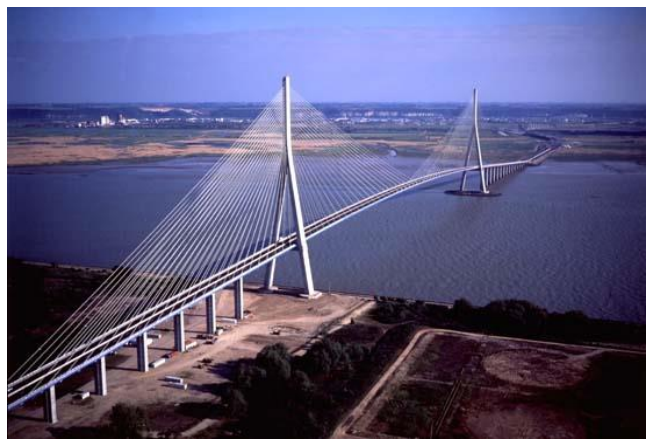
Figure 14 Photo of a cable-stayed bridge with inverted Y-Towers (Normandy Bridge over Seine River near Le Havre, France)

Single column towers have been used on a few cable-stayed bridges. These towers consist of a single column in the center of the bridge with a single plane of stay cables down the center of the bridge. The single plane of cables offers some economy in cable installation and maintenance. However, the transverse beams supporting the superstructure at each anchorage location are designed as cantilevers in both directions and will be somewhat heavier than beams supported by two cable planes at the outside edges of the bridge.