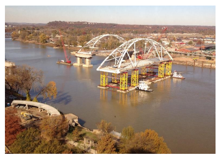
Figure 18 Photo showing an arch being floated into place (Broadway Bridge over the Arkansas River near Little Rock Arkansas)

can be floated into place if arch is over a waterway. Also, arches can be rolled into place with self-propelled modular transports (SPMTs). For additional information, see the FHWA's Accelerated Bridge Construction – Experience in Design, Fabrication and Erection of Prefabricated Bridge Elements and Systems [12].