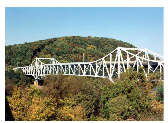
Figure 7 Photo of a steel half-through truss bridge (Glenwood Bridge over Monongahela River, Pittsburgh, Pennsylvania)

Half-through trusses carry the deck high enough that sway bracing cannot be used above the deck. Much of the previous discussion regarding through trusses also applies to half-through trusses. It is very difficult to design a half through truss if the chosen truss type does not have verticals. Without verticals, the deck must be supported from diagonal members away from the joints. This condition results in significant bending stresses in the truss members, which are generally not efficient in carrying bending, thus resulting in inefficient member designs for the diagonals. Many of the recent trusses designed in the United States have been designed without verticals to achieve a cleaner and more contemporary appearance, thus minimizing the use of half-through trusses.