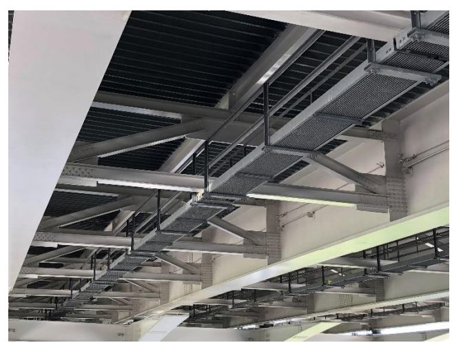
Figure 2 Photo of a typical girder substringer system showing a stringer sitting on top of cross-frames

As recently as the 1970s, many bridges were designed using two deck girders, transverse floorbeams at regular intervals, and longitudinal stringers either continuous over the floorbeams or framed into the floorbeam webs. The use of two-girder bridges was phased out in response to their fracture-critical nature, difficulty in widening, and a greater use of multi-girder bridges.. At the same time, composite construction became nearly universal for girder bridges. Designing for composite action allows the designer to account for the strength of the bridge deck in the section properties of the girders. In addition, the top flanges in the positive moment regions are fully braced in the final condition, allowing the use of higher allowable compressive stresses than are possible for flanges braced at discrete points. Both aspects led to the recent predominance of composite, multi-girder bridges.