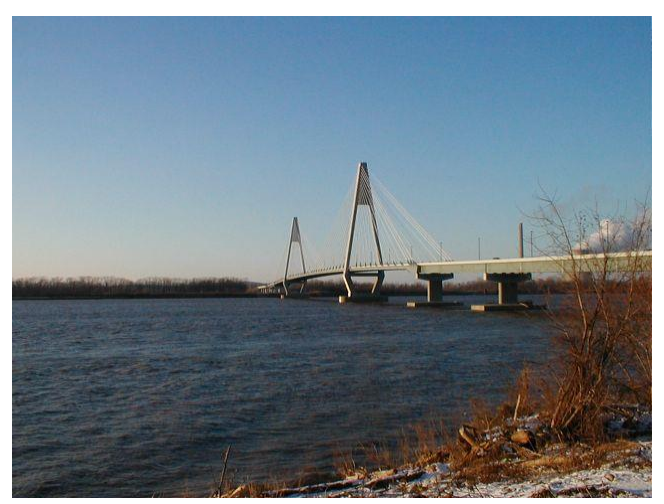
Figure 13 Photo of a cable-stayed bridge with A-Towers (William H. Natcher Bridge over Ohio River near Owensboro, Kentucky)

because every stay cable intersects the edge girders at a slightly different angle, exact repetition of anchorage geometry is not possible. There have been instances where steel edge girders have been fabricated with sloped webs in an effort to simplify the anchorage details, but there is some increase in fabrication cost for the sloped edge girders. The inwardly sloped cable planes exert compression into the superstructure in both the longitudinal and transverse directions. The sloped cables provide some additional torsional stiffness, which is particularly important on narrow and slender superstructures. In many cases, the center-to-center spacing of the edge girders needs to be increased so that the sloped cables do not infringe upon the vertical clearance envelope required to pass highway traffic.