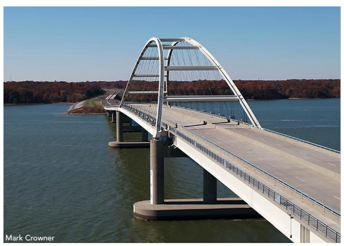
Figure 11 Photo of a steel tied arch bridge (Kentucky Lake Bridge in western Kentucky)

Tied arches are generally more effective in cases where deep foundations are required or where high piers may be required to achieve a desired clearance under the bridge, such as a long span crossing a river where a navigation clearance envelope must be provided.