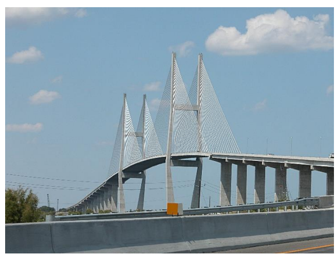
Figure 12 Photo of a cable-stayed bridge with H-Towers (Sidney Lanier Bridge over Brunswick River, Brunswick, Georgia)

There is a significant variety in tower configurations that have been used on cable-stayed bridges in the U.S. and around the world. H-Towers have two legs that rise vertically above the edge of the bridge and the cables are outside of the roadway. There is generally an intermediate strut part of the way up the towers but below the level of the stay cable anchorages. The appearance of H-Towers is more utilitarian than other shapes. One of the main advantages of the H-Tower is that the stay cables can be installed in a vertical plane directly above the edge girder. The vertical planes of stay cables simplify the detailing of the deck-level anchorages because the connections to the edge girders are parallel to the webs of the edge girders. If ice forms on the cables during inclement winter weather, it will not fall directly onto traffic.