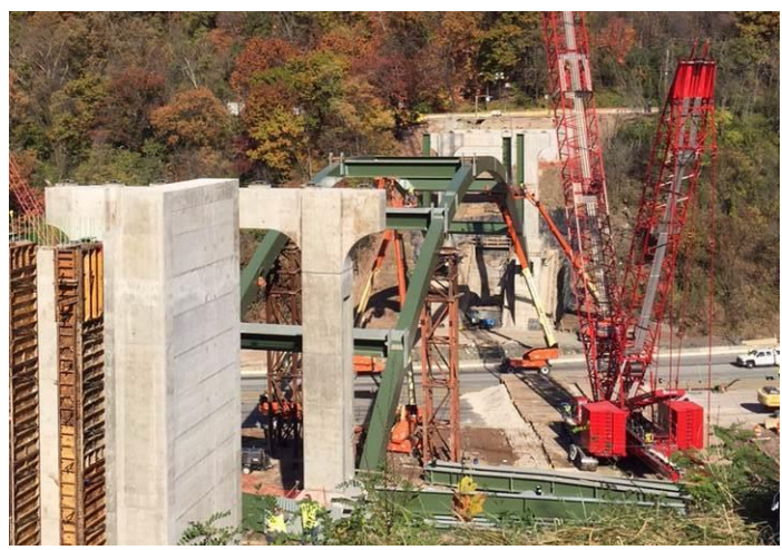
Figure 19 Photo showing the erection of a deck arch (Greenfield Bridge over Interstate 376 near Pittsburgh, Pennsylvania) (Credit: HDR)