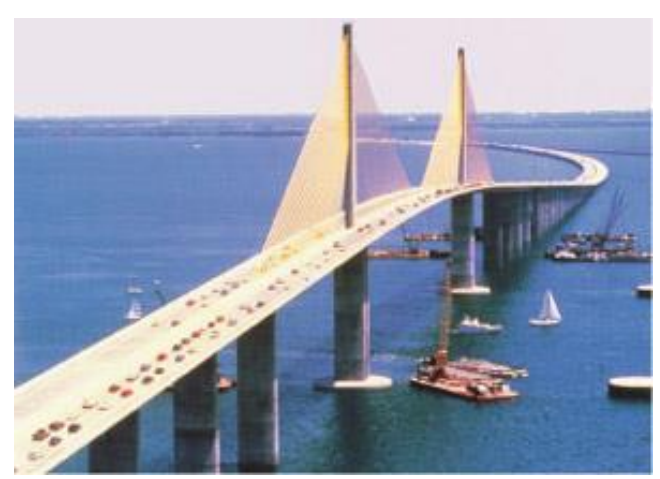
Figure 15 Photo of a cable-stayed bridge with single column towers (Sunshine Skyway Bridge, Tampa Bay, Florida)

Single column towers have been used on a few cable-stayed bridges. These towers consist of a single column in the center of the bridge with a single plane of stay cables down the center of the bridge. The single plane of cables offers some economy in cable installation and maintenance. However, the transverse beams supporting the superstructure at each anchorage location are designed as cantilevers in both directions and will be somewhat heavier than beams supported by two cable planes at the outside edges of the bridge.