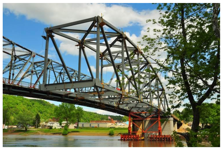
Figure 17 Photo showing the cantilever erection of a truss (Point Marion Bridge over the Monongahela River in southwestern Pennsylvania)

Alternatively, the trusses can be built off-site and floated in on barges. After the barges move into place, the trusses are typically strand jacked onto the piers. In certain situations, this can be more economical, but this depends on navigation restrictions, structure size, and site-availability for constructing the truss elsewhere. For additional information, see the FHWA's Accelerated Bridge Construction – Experience in Design, Fabrication and Erection of Prefabricated Bridge Elements and Systems [12].