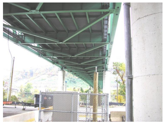
Figure 8 Photo showing a typical stacked floor system

There are two floor system configurations that are used for trusses. Stacked floor systems are the most commonly used detail in recent trusses. In a stacked floor system, the longitudinal stringers rest on top of the floorbeam top flanges, supported by bearings. The stringers are generally made continuous across several floorbeams. This allows for more efficient stringer designs with fewer pieces to fabricate and erect. It also minimizes deck expansion joints which may leak, reducing the probability of de-icing salts washing over the members below. Rolled W-shapes have most commonly been used for the stringers since they can efficiently span the normal panel lengths used for trusses.