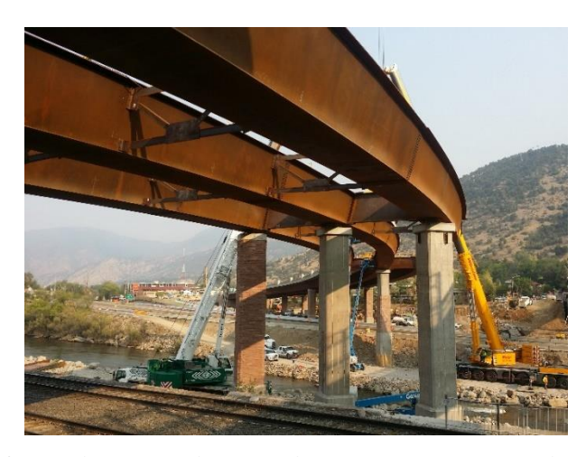
Figure 3 Photo of a typical tub girder bridge under construction

Steel tub girders are another option for a girder-type bridge. These types of bridges can handle more span ranges and complex curvatures than typical multi-girder bridges and are much simpler than complex structures such as trusses, arches, and cable bridges. These bridges provide a sort of middle ground between simple and complex bridges. In addition, many stakeholders appreciate their clean aesthetics.