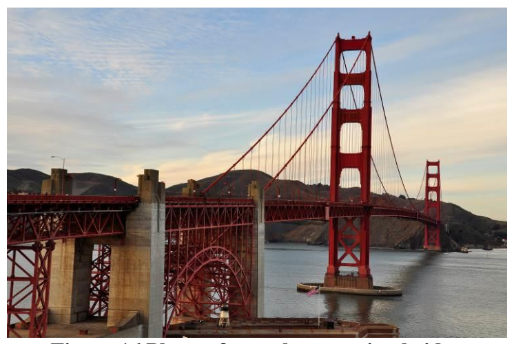
Figure 16 Photo of a steel suspension bridge (Golden Gate Bridge, San Francisco, California)

Suspension bridge superstructures are generally very light relative to their span length, which leads to structures that may be very flexible. The vertical stiffness is a complex interaction of the size and tension of the main suspender cables as well as the type and geometry of the floor system, such as stiffening trusses. Accordingly, it is common to provide a lateral stiffening truss under the deck to avoid excessive excitement of the superstructure under wind or seismic loadings. The first Tacoma Narrows Suspension Bridge illustrated the pitfalls of providing the lightest superstructure possible based on strength design while not considering the possible harmonic effects induced by lateral wind loads. The structure collapsed due to the harmonic frequency set up during a period of only moderately high winds.