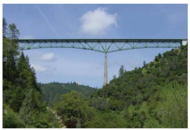
Figure 5 Photo of steel deck truss bridge (Foresthill Bridge over American River's North Fork, Auburn, California)

therefore the cost, of the lateral bracing and sway frames. Deck trusses are generally more feasible in cases where vertical clearance below the bridge is not restricted. Deck trusses result in more economical substructures because they can be significantly shorter since the bridge is below the deck. Deck trusses are also easier to widen in the future since the deck is above the trusses. Future deck widening is limited only by the increased structural capacity obtained by modifying or replacing the floorbeams and strengthening the truss members.