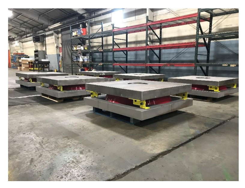
Figure 3 Disc Bearings