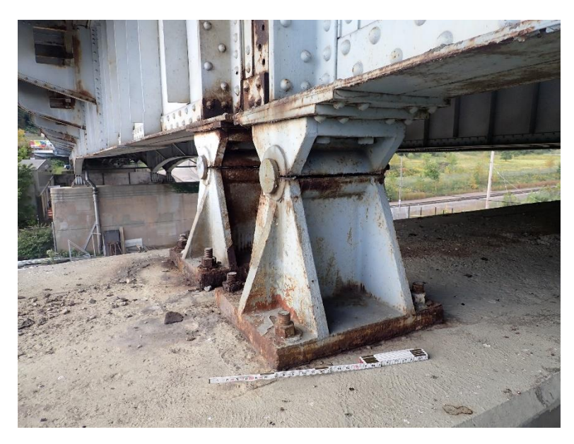
Figure 4 Fixed Mechanical Bearing