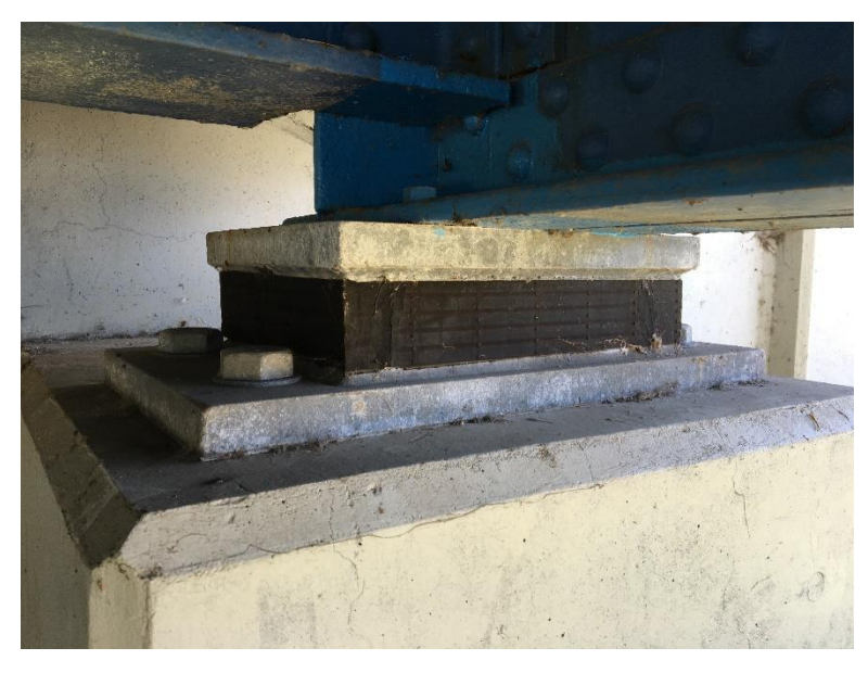
Figure 1 Elastomeric Bearing