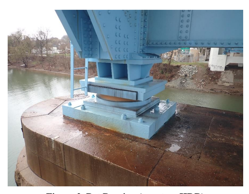
Figure 2 Pot Bearing

from the piston and pot to the sole and masonry plates through bearing and by mechanical connections. Several Owner-agencies still specify the use of pot bearings to fill their HLMR bearing needs, but many others allow disc bearing alternates or have abandoned pot bearings all together due to durability/maintenance issues with the various mechanical parts associated with the piston, the machined pot plate, and the sealing rings.